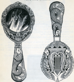
This Cut represents No. 1, half size, Front and Back Views.

Having unequalled facilities for the manufacture of articles in this line, our assortment is the most extensive in the world.